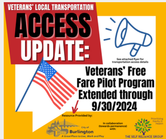
Veterans' Free Fare Pilot Program Extended through 9/30. Collaborating with the community towards resource permanence.

Want to see your business featured as a local sponsor? Check out The Group's website for sponsorship package details.