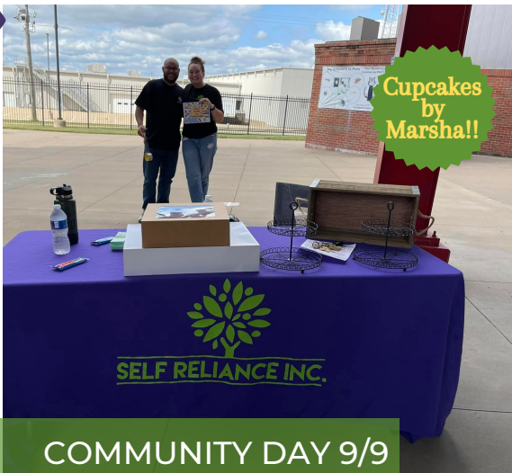
COMMUNITY DAY 9/9 Mental Health is a 'Cake-walk' game

After 3 short hours, The Group had distributed over 70 cupcakes and positively interacted with over 70 kiddos. This was done by asking them to participate in a cakewalk and answer an age-appropriate question about mental health and natural supports.